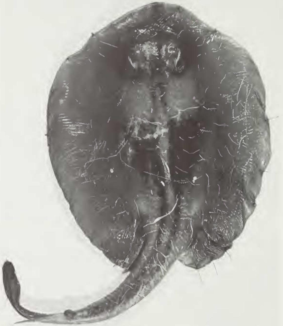
Figure 1. Trygonoptera ovalis , holotype, CSIRO CA521.